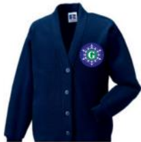
CARDIGAN GLAS TYWYLL (BATHODYN YSGOL DEWISOL) NAVY CARDIAGN (SCHOOL BADGE OPTIONAL)