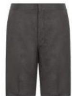
TROWSUS, SGERT, SIORTS TEILWREDIG NEU FFROG BINER DULWYD.