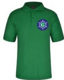
CRYS POLO GWYRDD (BATHODYN YSGOL DEWISOL) GREEN POLO SHIRT (SCHOOL BADGE OPTIONAL)