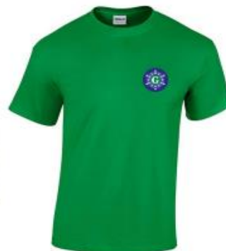
TRACWISG NEU SIORTS GLAS TYWYLL. CRY S T GWYRDD (BATHODYN YSGOL DEWISOL) NAVY JOGGERS OR SHORTS. GREEN T SHIRT (SCHOOL BADGE OPTIONAL)