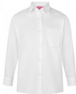
CRYS NEU BLOWS GWYN WHITE SHIRT OR BLOUSE