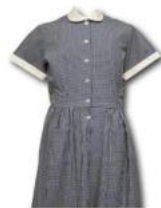
FFROG GINGHAM GLAS TYWYLL NAVY GINGHAM DRESS