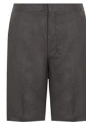
TROWSUS, SGERT NEU SIORTS TEILWREDIG DULWYD CHARCOAL GREY TROUSERS, SKIRT OR TAILORED SHORTS

DIM NEWID GYDA'R THEI YSGOL NA'R CIT ADDYSG GORFFOROL NO CHANGE WITH SCHOOL TIE OR PE KIT