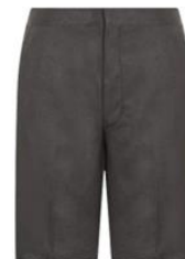
TROWSUS, SGERT NEU SIORTS TEILWREDIG DULWYD CHARCOAL GREY TROUSERS, SKIRT OR TAILORED SHORTS

DIM NEWID GYDA'R THEI YSGOL NA'R CIT ADDYSG GORFFOROL NO CHANGE WITH SCHOOL TIE OR PE KIT