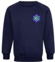
CRYS CHWYS GLAS TYWYLL (BATHODYN YSGOL DEWISOL) NAVY SWEATSHIRT (SCHOOL BADGE OPTIONAL)