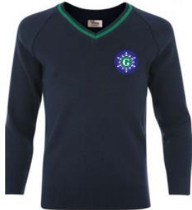
SIWMPER GLAS TYWYLL/STREIPEN WERDD GYDA BATHODYN YR YSGOL NAVY JUMPER/GREEN STRIPE WITH SCHOOL BADGE