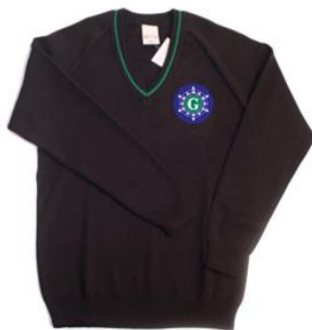
SIWMPER DU/STREIPEN WERDD GYDA BATHODYN YR YSGOL BLACK JUMPER/GREEN STRIPE WITH SCHOOL BADGE